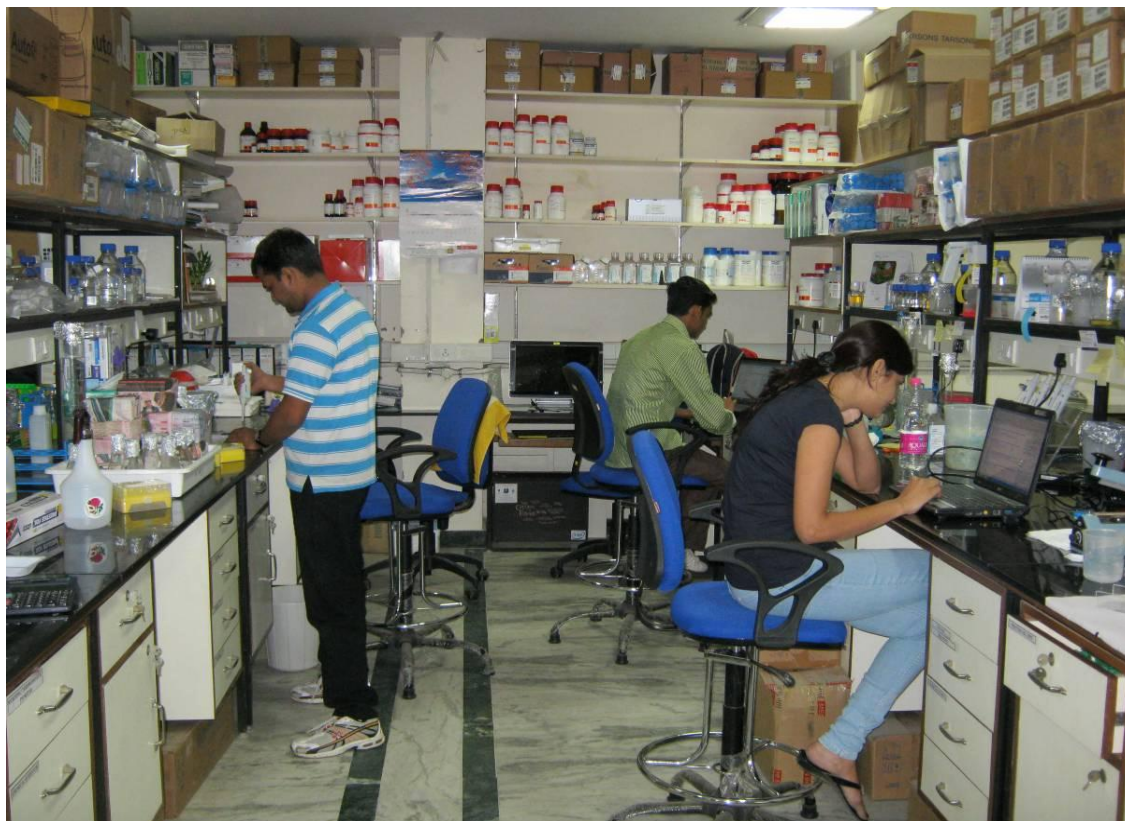
A Research Laboratory