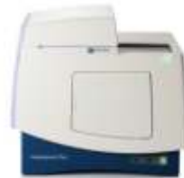
IX - Pico

–Integrated cell imaging and analysis in one affordable system