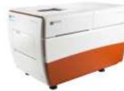
IX - Nano

–Cost-effective automated microscopy for common biological assays